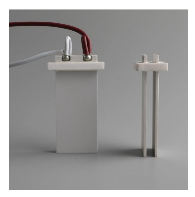
Plate Ceramic Water Heater Element For Smart Toilet

GREENWAY Plate Ceramic Water Heater Element for Smart Toilet was developed based on ceramic lamination technologies, which are mainly used for automotive and various industrial applications such as soldering iron, kerosene & gas equipment, pellet burner and instant water heating. Model:P7030TA